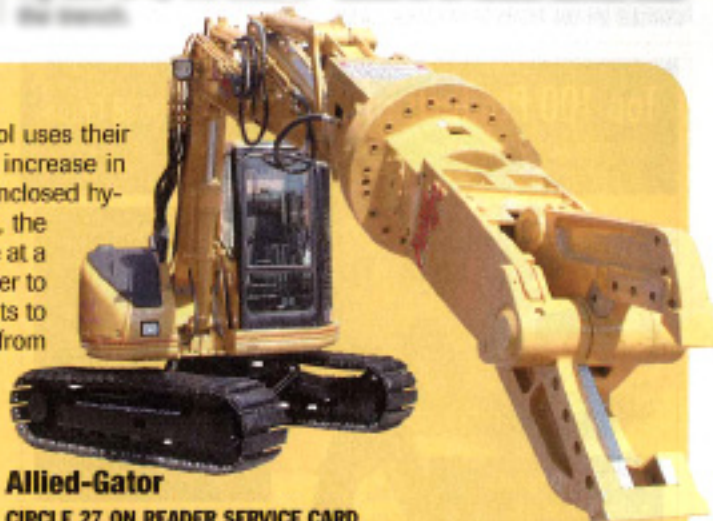
Allied-Gator CIRCLE 27 ON READER SERVICE CARD

Available in 11 sizes, the Allied-Gator MT Series Multi-Tool uses their unique Power-Link and Guide System to provide a steady increase in power and control over the tool as it closes. From the fully enclosed hydraulic cylinder to the unique, disposable wear components, the MT Series Multi-Tool is designed to require less maintenance at a lower cost than any other processor, and to be easier and faster to service in the field. The modular design allows pin-on jaw sets to be switched out and the tool to be reconfigured in minutes from Shear to Cracker/Crusher for maximum versatility—without the hassle of hydraulic hose removal. Cutting-edge, proprietary features such as Allied-Gator Speed-Circuit Technology, centerline cycling, with 360 degree rotation deliver faster cycle times, provide pinpoint accuracy, and eliminate clumsy material positioning and operator blind spots.